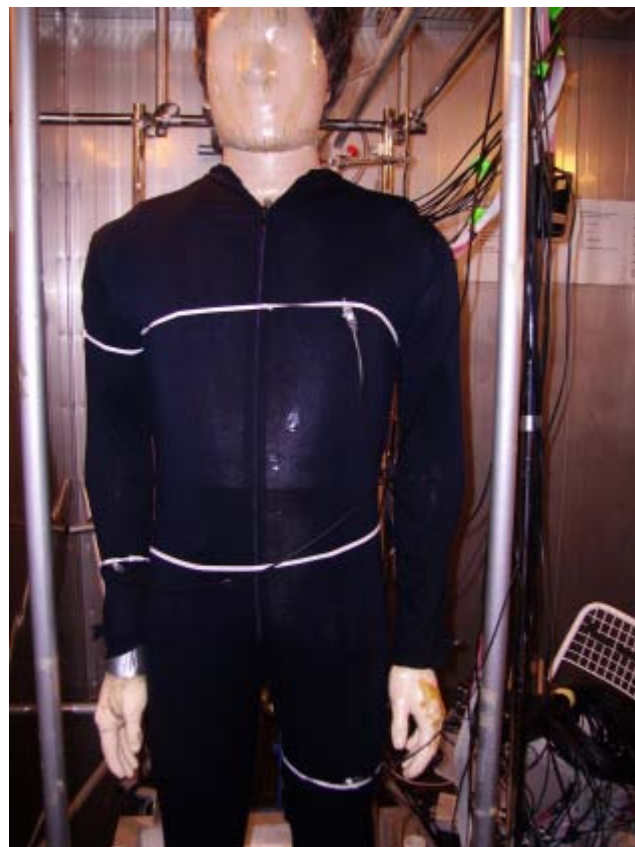
Figure 1 The thermal manikin ‘Tore’ in the climatic chamber.

evaporative heat loss, as radiative and convective gradients will be zero.