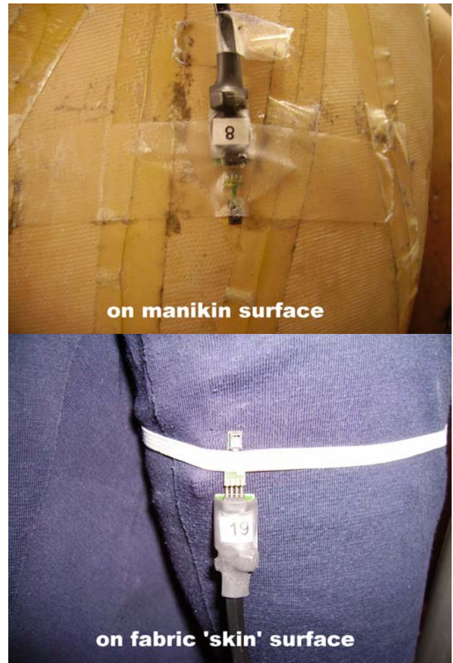
Figure 2 Sensor attachments applied in the study.

bottom of one side wall. In the determination of sensor attachment section, the partial vapour pressures in the climatic chamber were set at 1, 2, 3 or 4 kPa, respectively (the observed relative humidities were 25.6, 40.9, 52.5 and 72.2 %, respectively). Eighteen digital temperature and humidity integrated sensors (SHT75, CMO Sensirion, Switzerland, accuracy: \pm 0.3 °C) were used in the tests. Twelve sensors were attached to the nude manikin surface at 12 positions (the left upper arm, left lower arm, right lower arm, right upper arm, right scapula, right lower chest, left upper chest, left lower buttocks, right shin, left calf, right posterior thigh, and the left anterior thigh) using waterproof surgical tapes (3M, USA). Other six sensors were attached to the wet skin outer surface at 6 points (the left anterior thigh, left upper chest, left lower buttock, right upper arm, right lower arm and the right upper back) using white thread rings (Resårband Gummilitze Elastic Braid, Sweden). Both sensor attachments are shown in Figure 2. In the equation validation part, four functional clothing ensembles were used. All tests were conducted at an ambient temperature of 34.0 °C and the RH value was 37.6 %. The measurements of thermal and evaporative resistances of the four clothing ensembles were conducted following ISO 15831 and ASTM F 2370 [13, 14]. The details of the four functional clothing ensembles are listed in Table 1.